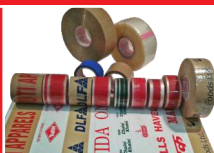
BOPP SELF ADHESIVE TAPES