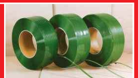
PET STRAPPING ROLLS