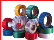
PP STRAPPING ROLLS